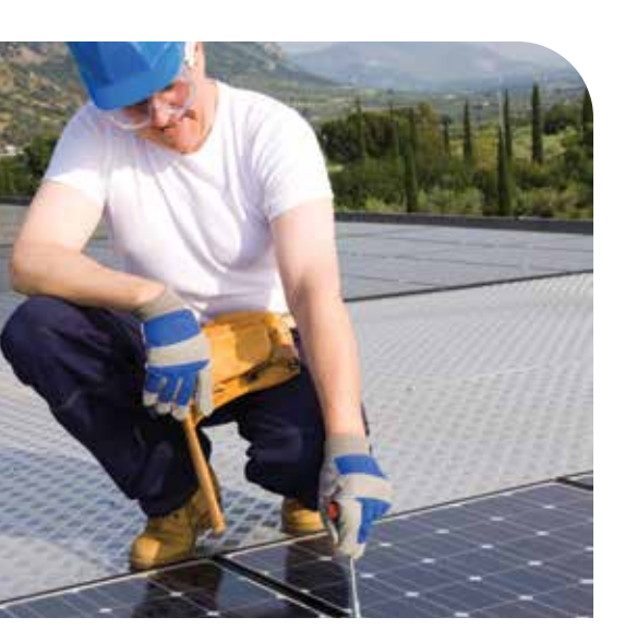
Praxis' high social impact investments include solar and wind installations.

For many investors today, making money isn't enough. They also want their investments to make a difference.