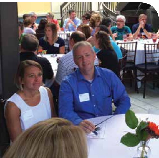
Everence staff in New Orleans last fall