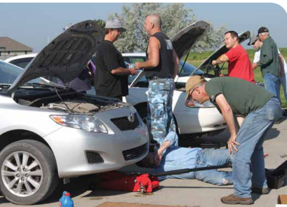
A group of men offers free "road service" at a Kansas church.

If you'd like to donate, send your contribution to Attn: Sharing Fund, Everence, PO Box 483, Goshen, IN 46527 or donate at everence.com/donate .